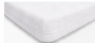
Dust proof 3D inner sleeve