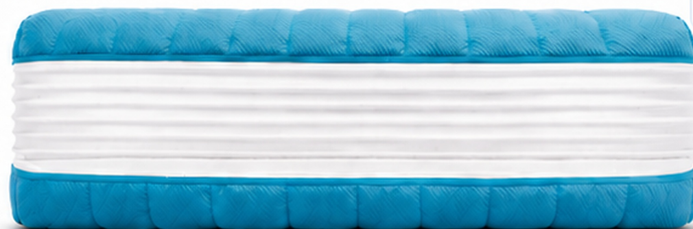
3-component modular build