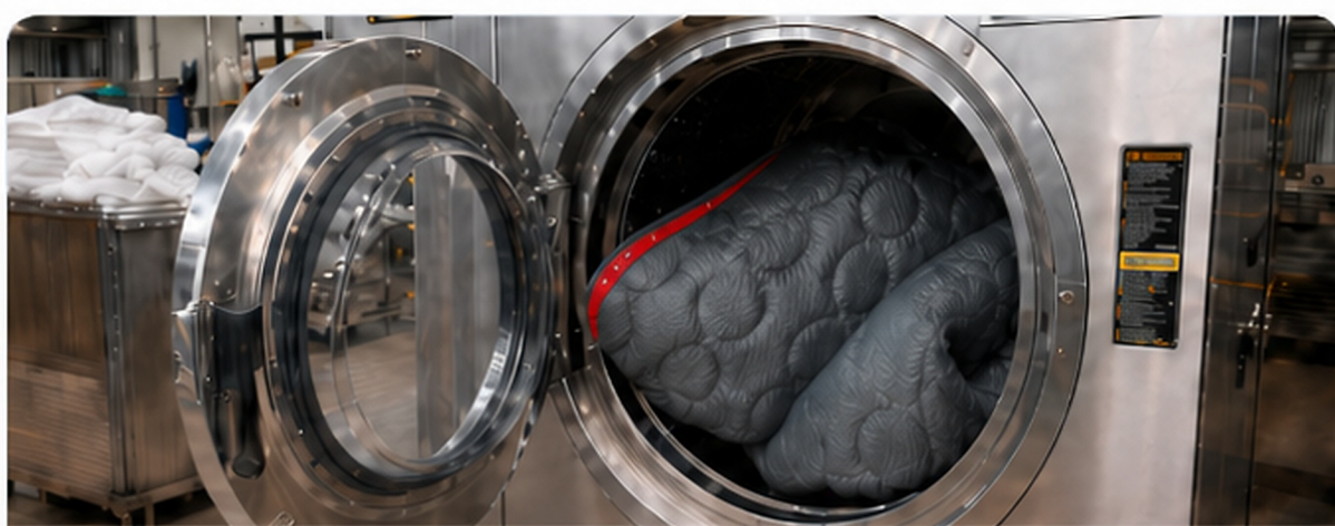
Commercial laundry compatible