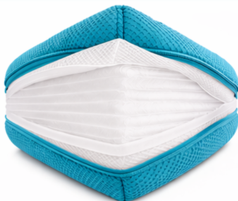
Aircitor 1.0 · product detail